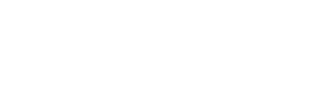
This article appeared in the Fernandina Beach News-Leader October 14, 2020