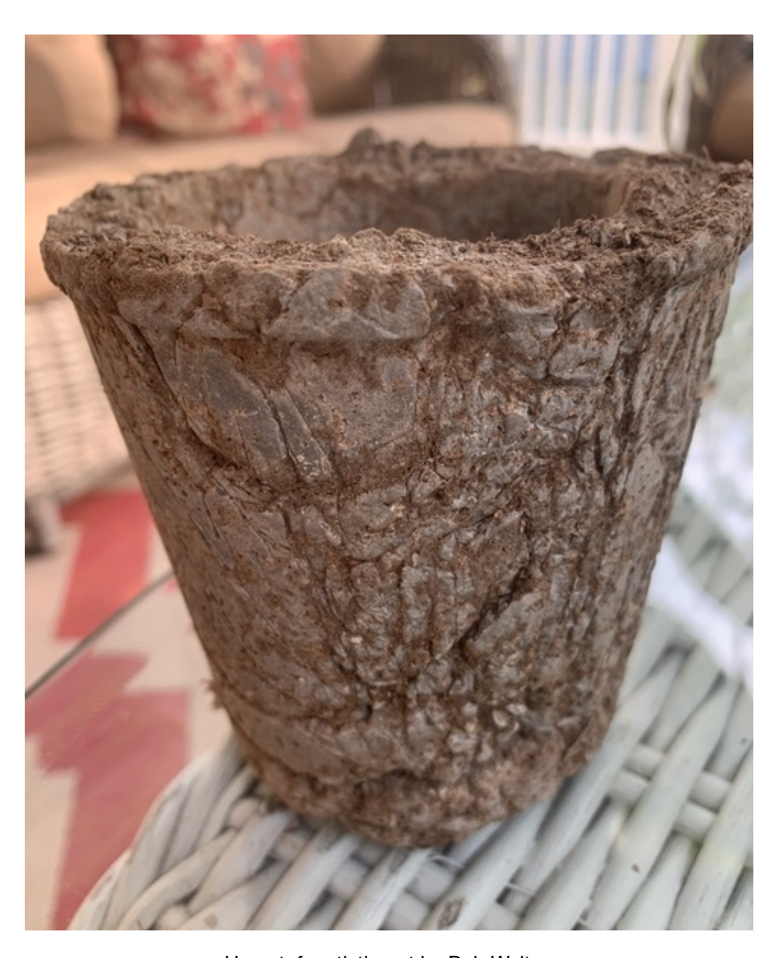
Hypertufa artistic pot by Deb Walton