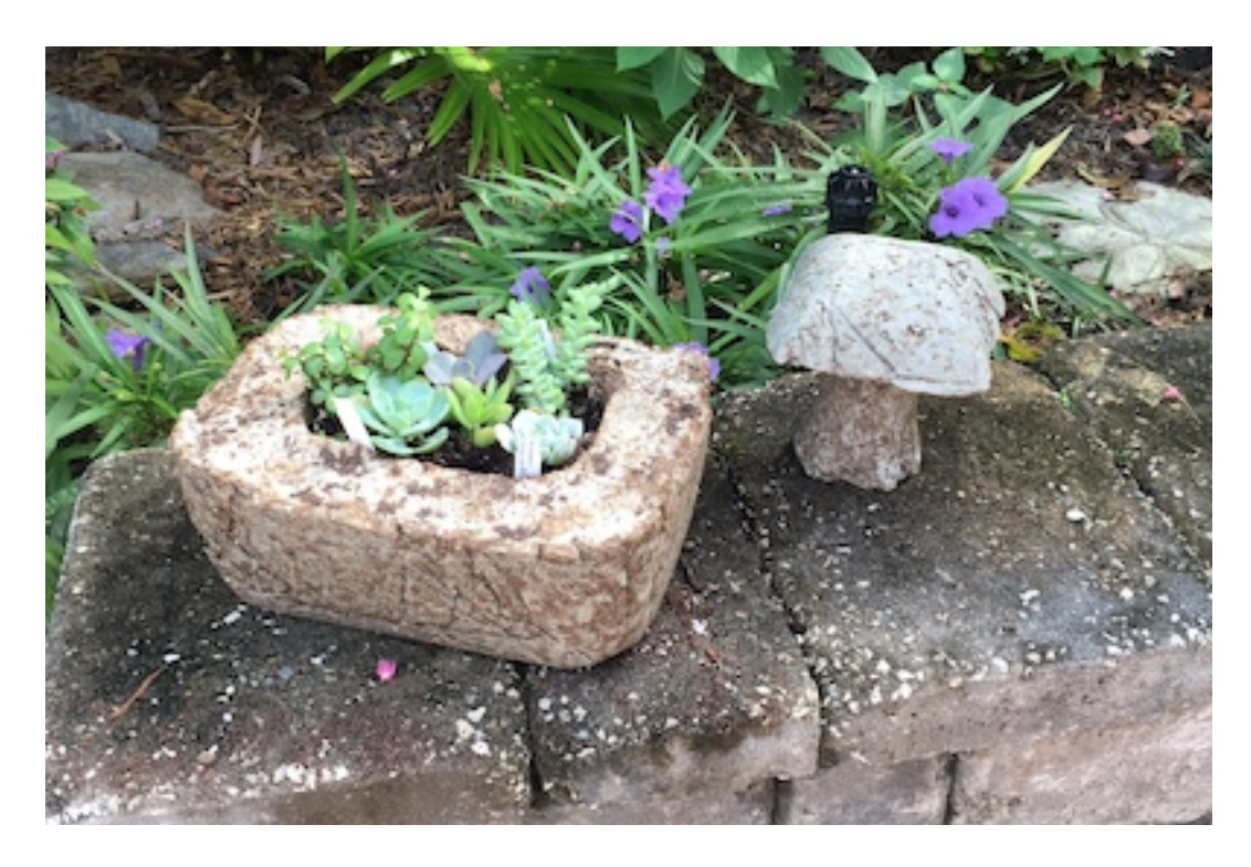
Hypertufa container and mushroom by Sue Dwyer